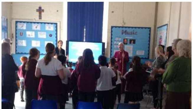
A partner in the Thundridge and Tonwell St Mary's Church Schools' Federation 'A community learning together in God's love'